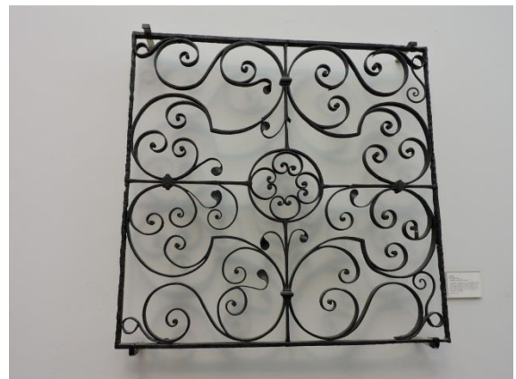
Just a few ideas.