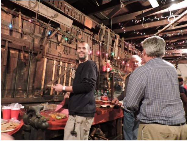
Now that's a happy face!

The second annual RCBA Christmas party took place on our regular Monday meeting night. Well, it actually started much earlier in the day with open forges and lots of yummy treats to eat.