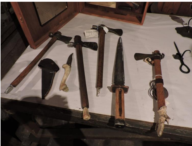
Everything in a blacksmith shop is dirty, hot, and/or sharp. Guess which these are.