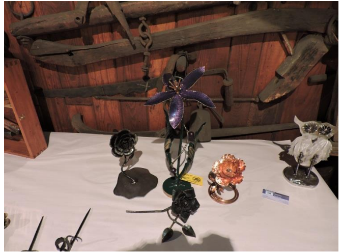
Show and Tell