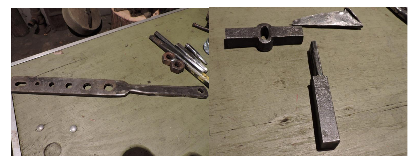
Punch and tool for finding 120 degrees